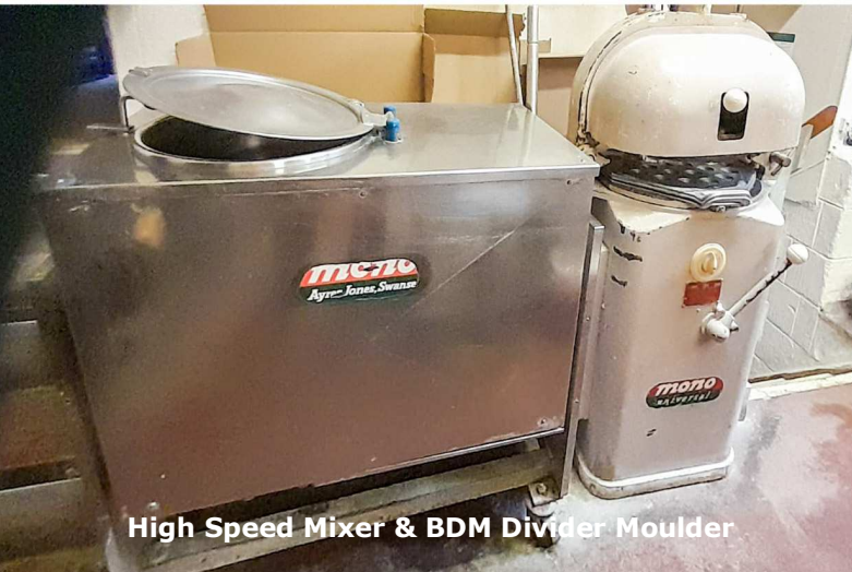
High Speed Mixer & BDM Divider Moulder