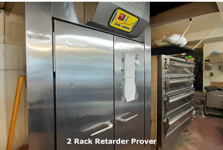
2 Rack Retarder Prover