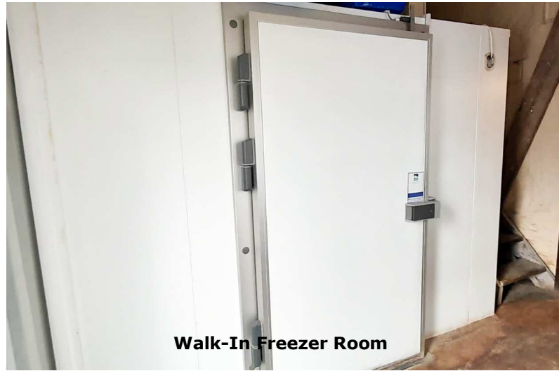
Walk-In Freezer Room