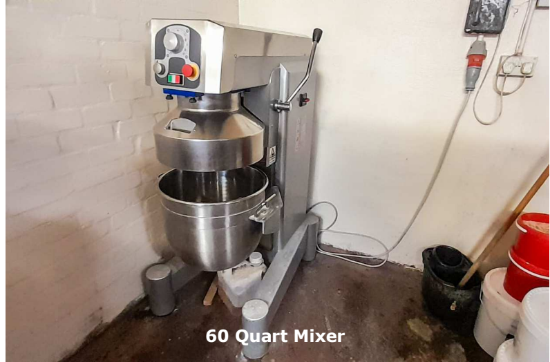
60 Quart Mixer