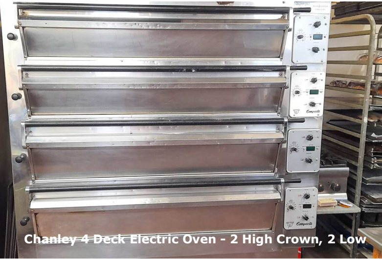
Chanley 4 Deck Electric Oven - 2 High Crown, 2 Low